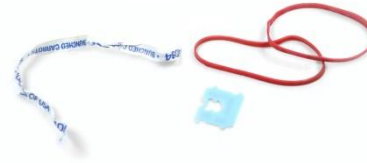
Twist Ties, Bands, and Clips