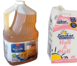
Oils and Liquids