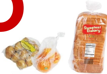
Produce and Bread Bags