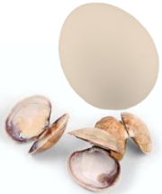
Eggs and Shells