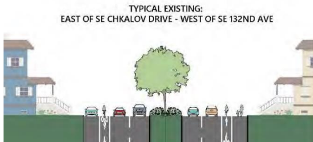
Road configuration since 1972

Christopher P.O. Box 872134 Vancouver, WA 98684