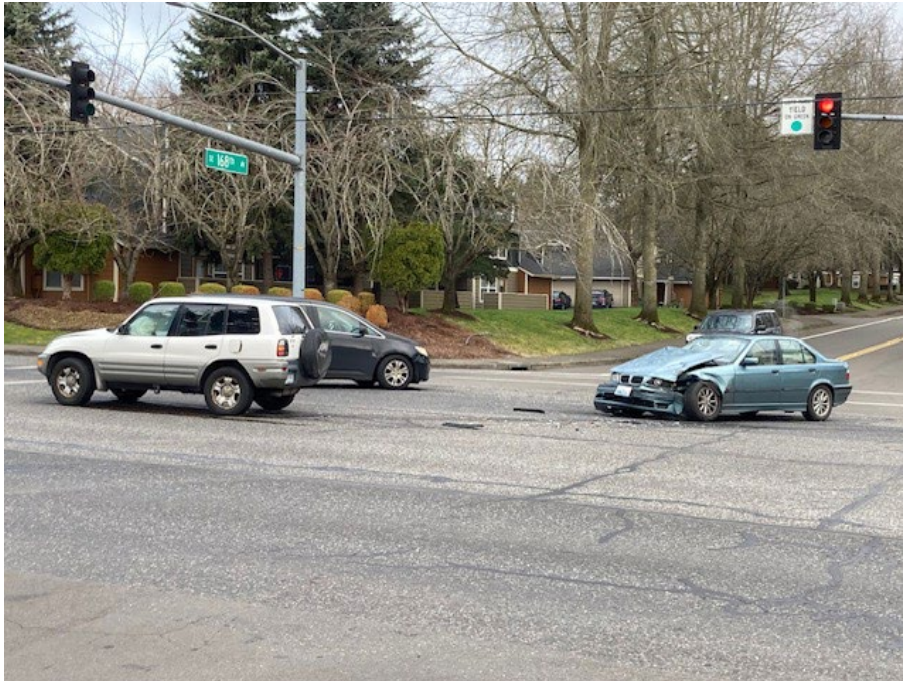
Intersection of SE 34th and SE 168th Avenue - 10:15 AM PDT - March 13, 2024 - Looking North up SE 168th Avenue