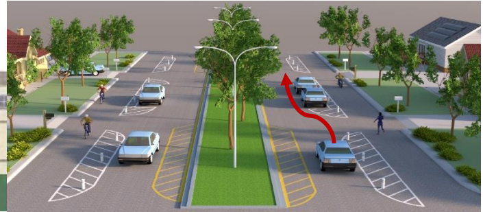
Planned roadway. Note serpentine driving pattern.

In February of 2023 an open house was held for residents at our middle school, 130 people attended and 110 signed up for additional information and updates. The meeting became contentious as the residents learned only then that they were losing a traffic lane and the purpose of this meeting was to discuss what to do with it now that it was gone.