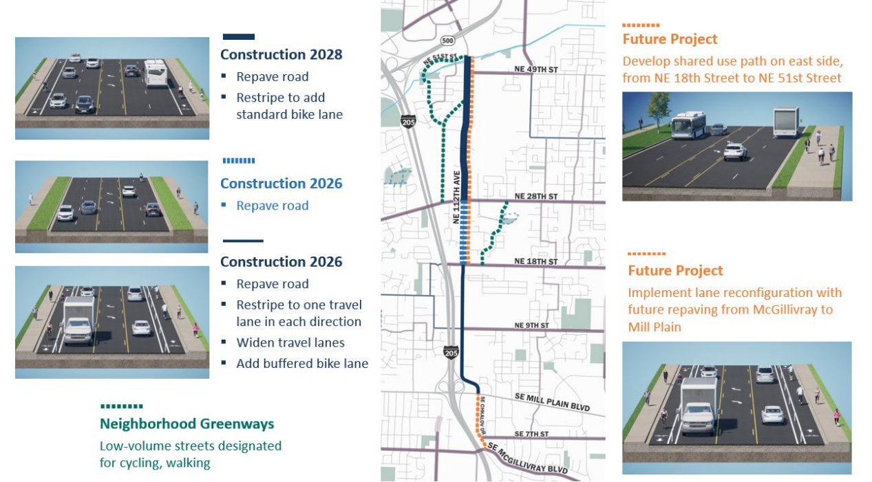
Figure 2. Near-term and future corridor-wide small mobility investments

Figure 2 shows recommended near-term and future projects to improve mobility for people walking and rolling corridor-wide. Near-term projects coincide with planned paving in 2026 and 2028, while future projects would be programmed through the Transportation Improvement Program as funding allows. In the near-term, the bike and small mobility lane gap between NE 18<sup>th</sup> Street and NE 28<sup>th</sup> Street on 112<sup>th</sup> Avenue would not be fully addressed; a proposed Neighborhood Greenway on NE Four Seasons Lane to the east of the corridor would provide a north-south connection for people rolling east of the immediate 112<sup>th</sup> Avenue corridor. Future projects would address this gap by procuring right-of-way to build an off-street shared use path.