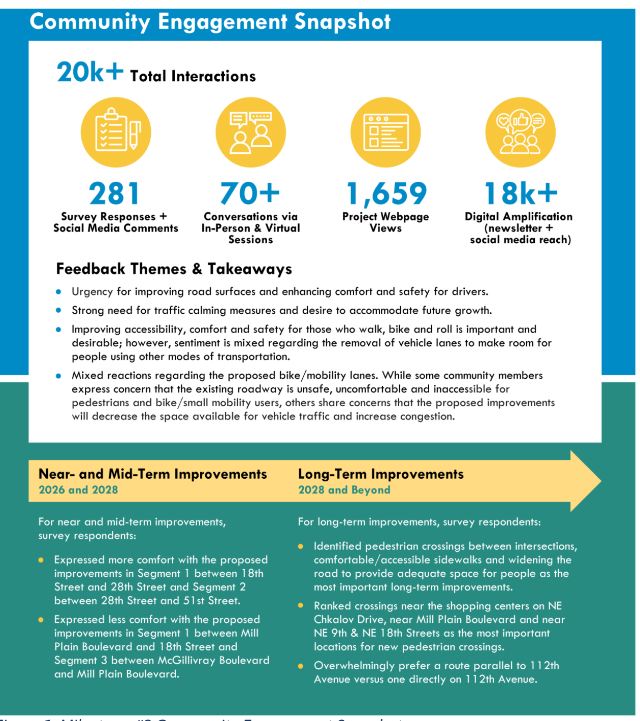
Figure 1. Milestone #2 Community Engagement Snapshot

Milestone 2 was completed in June 2024. Engagement activities and key themes heard are shown in Figure 1.