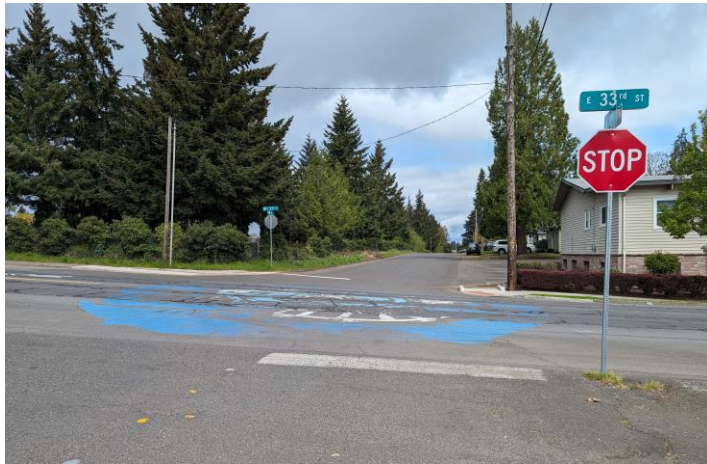
Figure 12: 33 rd Street features community intersection paintings at K Street and R Street, but both are although fading.