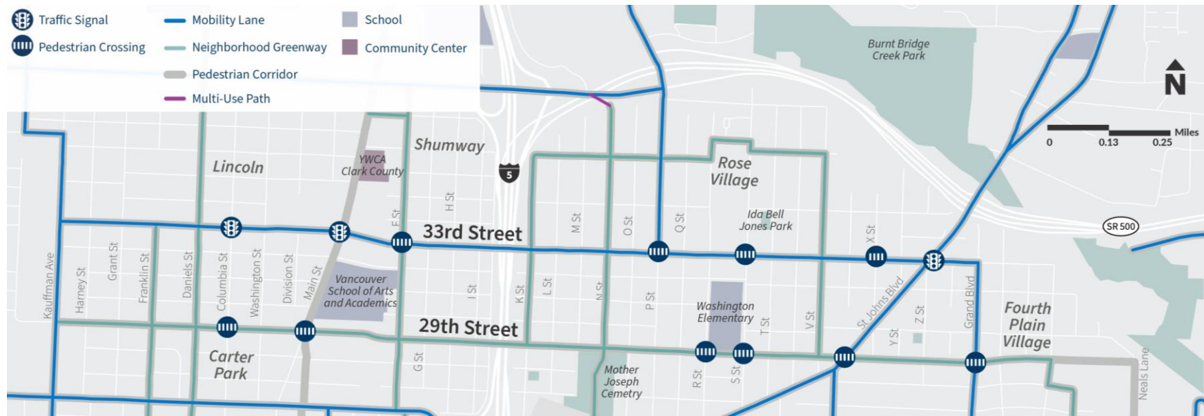
Figure 7: TSP-Identified Priority Active Transportation Networks

Priority Pedestrian Corridors include designated spaces for people to walk or roll. Treatment varies by roadway context, but typically includes complete sidewalks, curb ramps, and buffer space between the sidewalk and roadway. Neighborhood Greenways are low-stress neighborhood roadways with improvements that calm traffic, divert vehicle traffic to other corridors, support navigation along the route, and prioritize bicycle and pedestrian movement. Mobility Lanes are in street mobility facilities that designate space for people biking or using small mobility devices. The lane may be marked with a painted line, painted or physical buffer, or vertical separation.