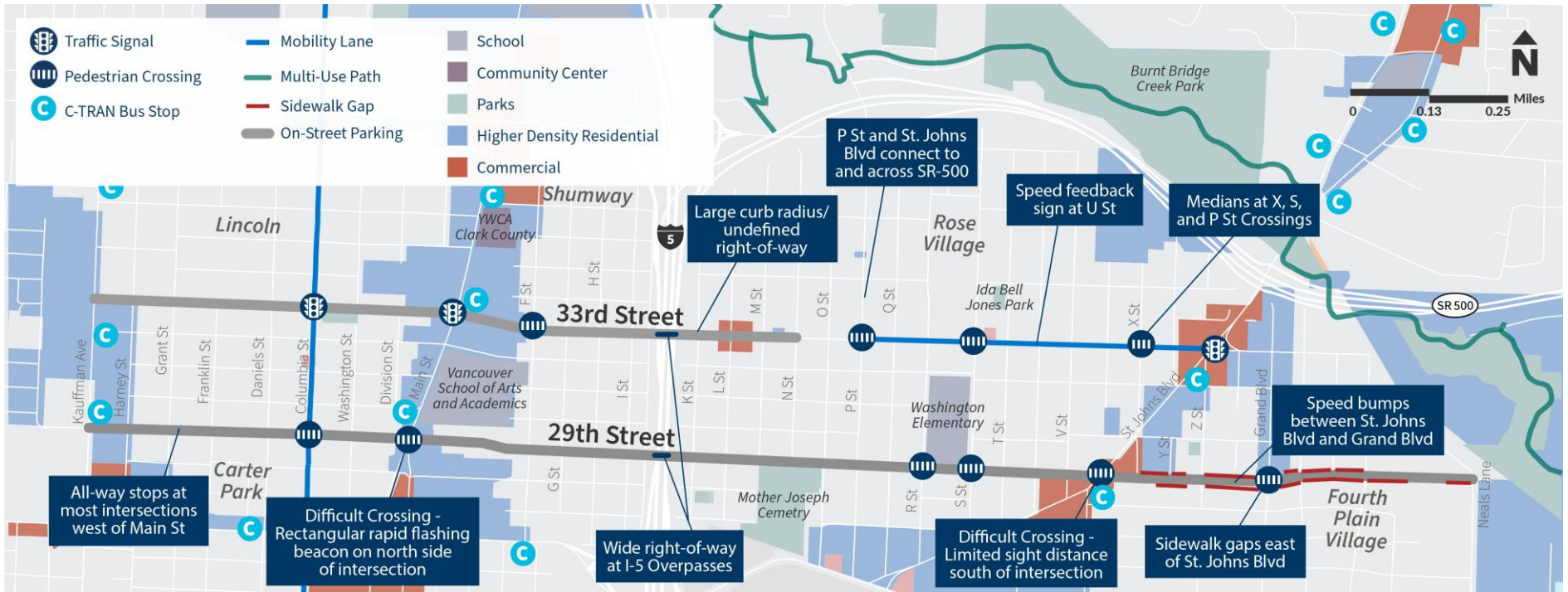
Figure 6: Existing Conditions Summary