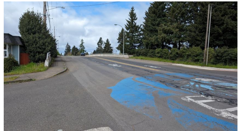
Figure 5: The I-5 Overpass is wide, with sharrows and attached sidewalks.