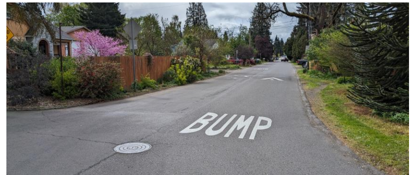
Figure 3: Speed bumps provide traffic calming on the eastern end of the study corridor.