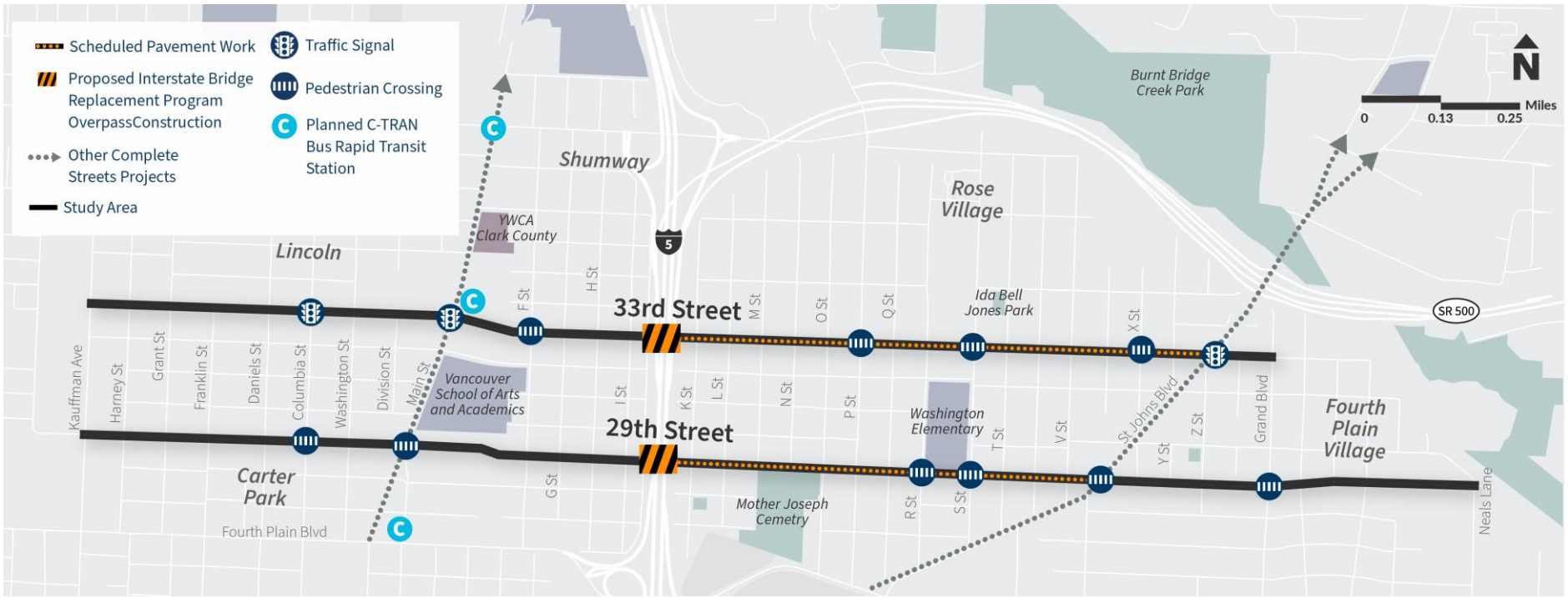
Figure 1. Project Area Map