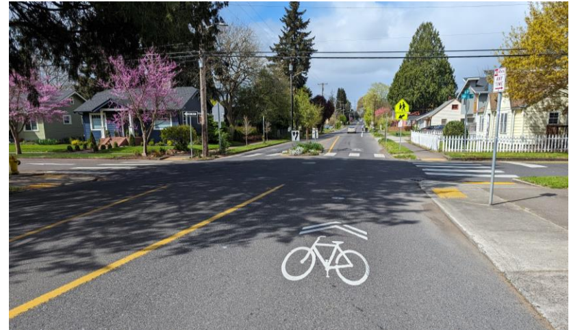
Figure 4: At midblock crossing locations east of N Street, the mobility lane changes to shared lane markings (sharrows), creating an inconsistent facility for bikes and small mobility.

Existing conditions are summarized in Table 1, as well as shown in Figure 6.