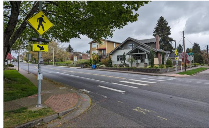
Figure 14: At 29 th Street and Main Street, a continental crosswalk and rectangular rapid flashing beacon (RRFB) are located on the north intersection leg. Coordination with the Upper Main Street project will help identify intersection approach options along 29 th Street.