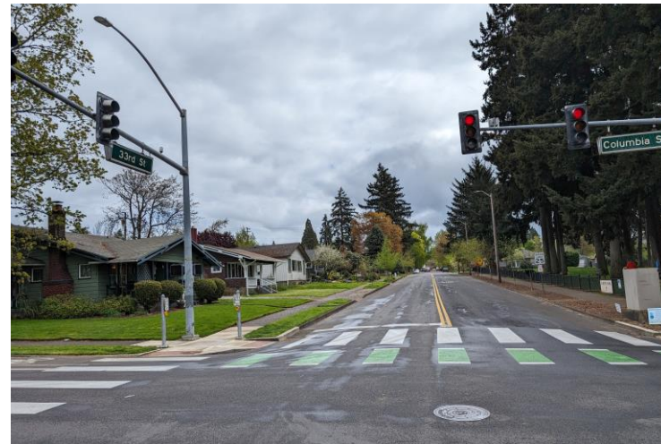
Figure 15: The intersections on 29 th and 33 rd Streets with Columbia Street create an opportunity to seamlessly connect with existing low-stress network routes.