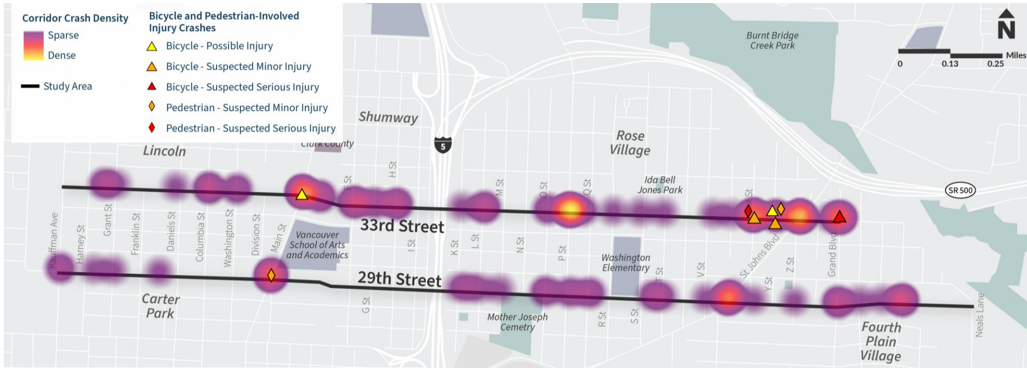
Figure 9: Corridor Crash Density (2018-2022)