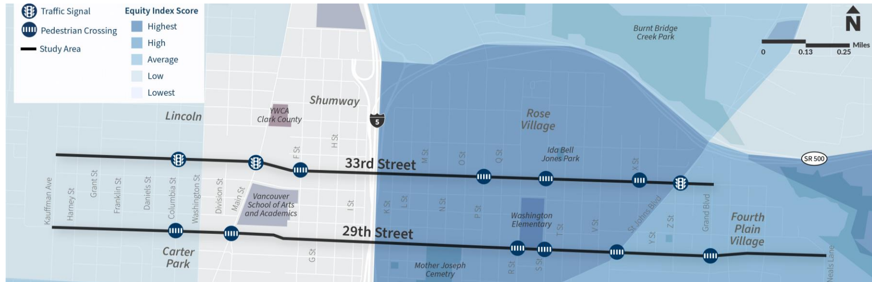
Figure 8: Vancouver Equity Index