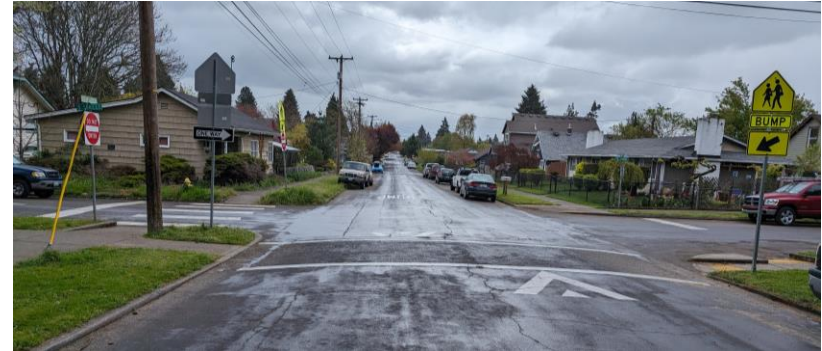
Figure 2: A raised crosswalk at S Street helps slow traffic for students crossing 29 th Street.

Washington Elementary School and Park is located between R Street and S Street, which is a key active transportation destination in the corridor. A school zone is present on 29 th Street in front of the school, where the speed limit reduces to 20mph when children are present.