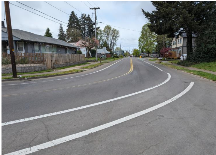
Figure 13: The eastern end of the study area includes a transition from 33 rd Street to Grand Boulevard for the minor arterial, giving priority for traffic along this route. This intersection was the location of a suspected serious injury bicycle crash.