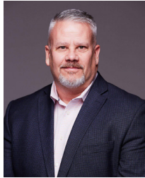
Michael Brennan Lifesaving Award

The Lifesaving Award is given to an officer or citizen who is directly responsible for the saving of a human life. Documentation and supporting evidence, which may include statements of witnesses, physicians, or supervisors, must be included to substantiate the award. This award is also appropriate in those circumstances where the action of an officer prolonged human life to the extent of the victim being released to the care of medical authorities, even though the victim may have expired at a later time.